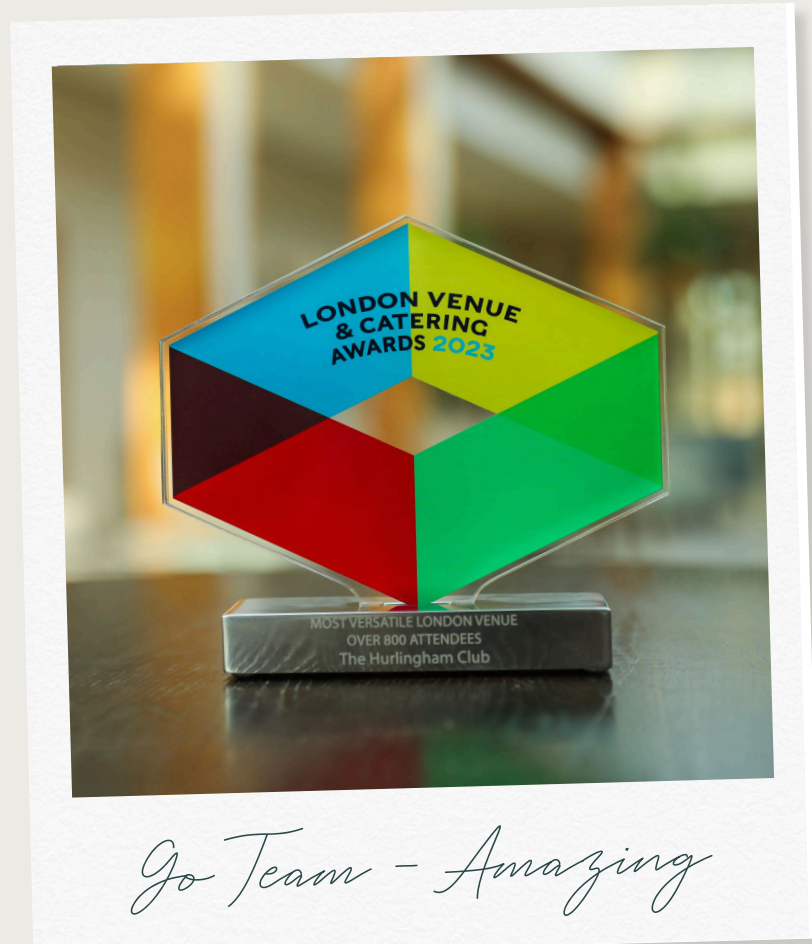
Go Team - Amazing

We also made it to the finals of the 2023 Best Venue Team.